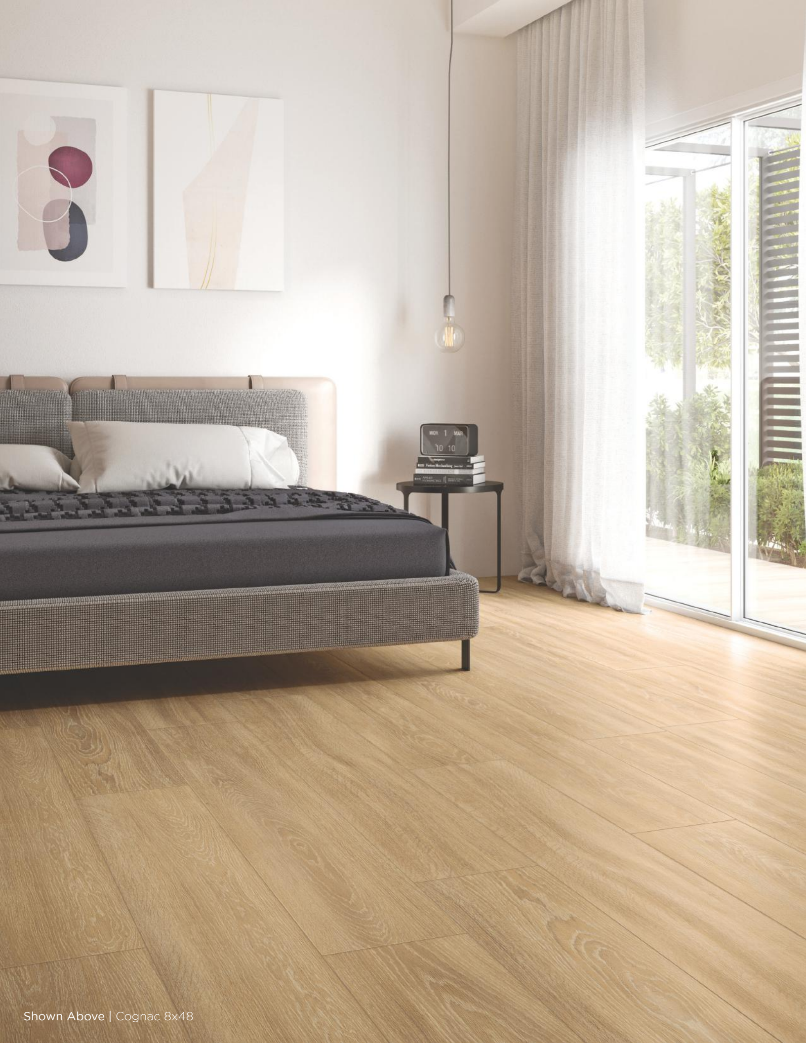
Shown Above | Cognac 8x48