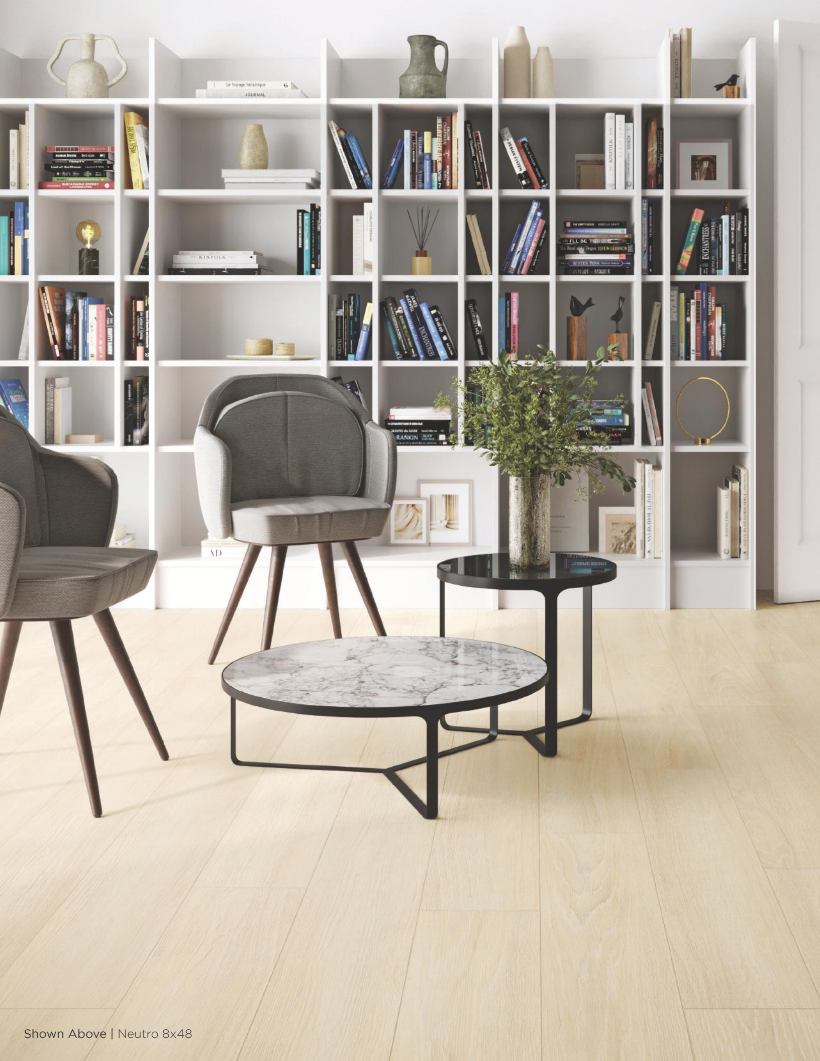
Shown Above | Neutro 8x48