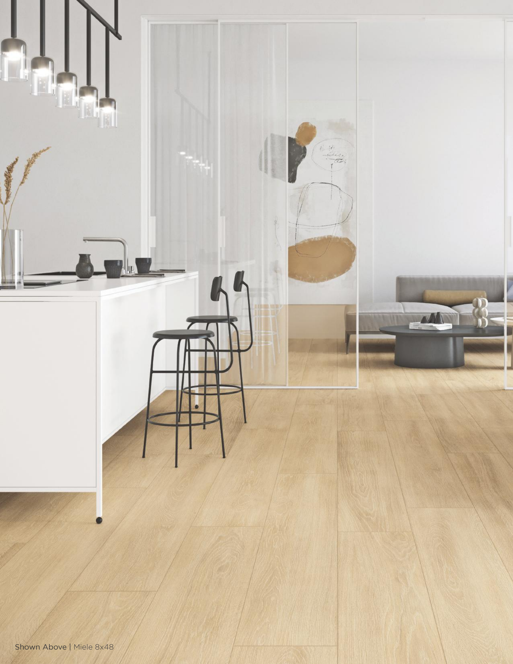
Shown Above | Miele 8x48